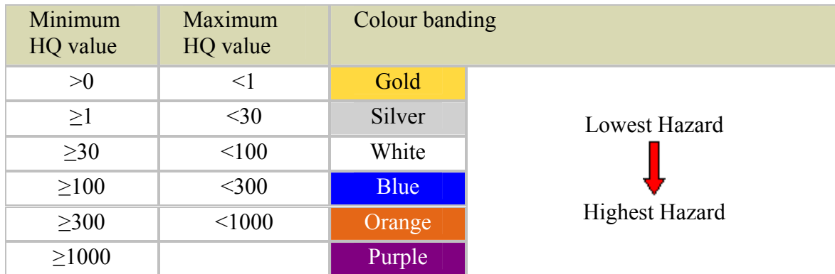
Table 1: The OCNS HQ and colour bands 1

The following tables describe the toxicity and HQ values associated with the OCNS ratings: